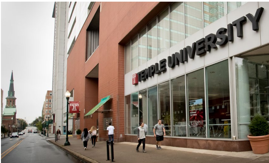
Students walk to class at the Harrisburg campus.

These crime statistics include reports from the students, staff, visitors, and those traversing the university area.