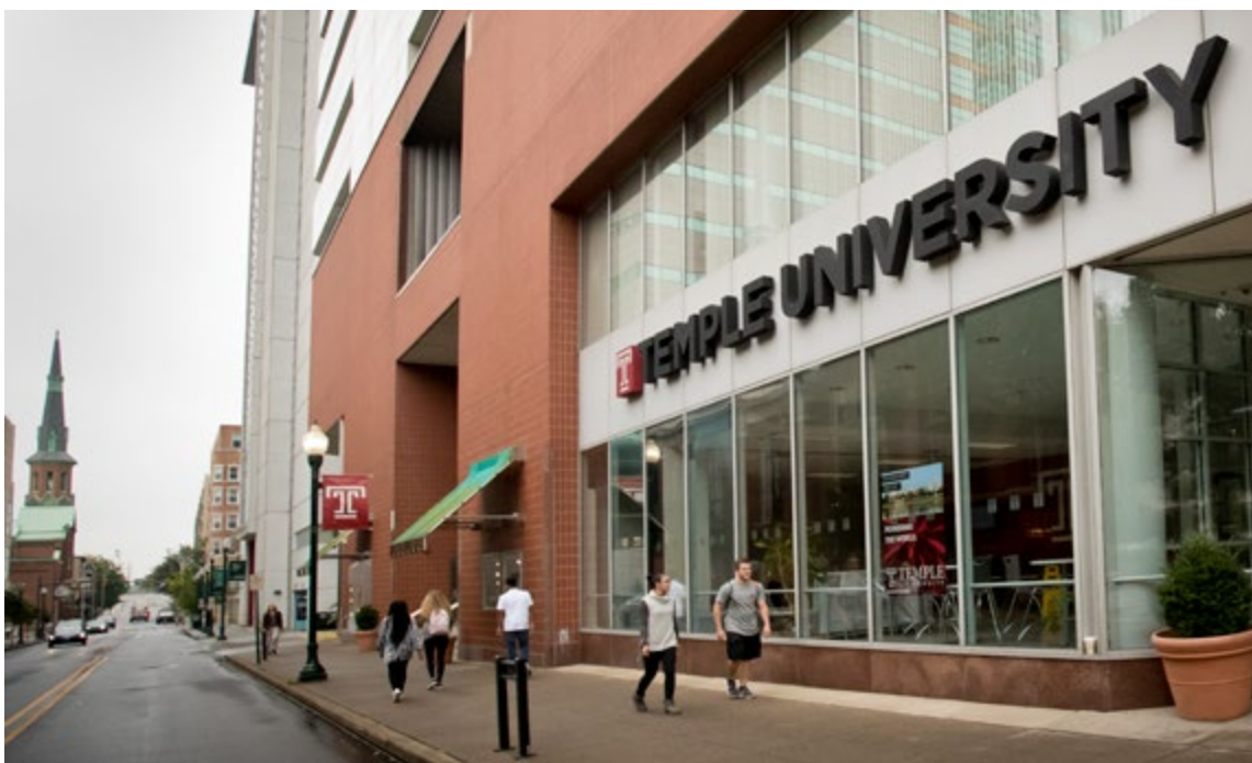
Students walk to class at the Harrisburg campus.

These crime statistics include reports from the students, staff, visitors, and those traversing the university area.