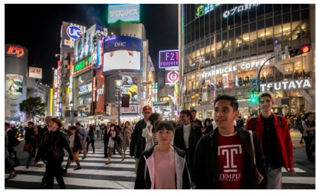
Students enjoy the night life in Japan.

These crime statistics include reports from the students, staff, visitors, and those traversing the university area.