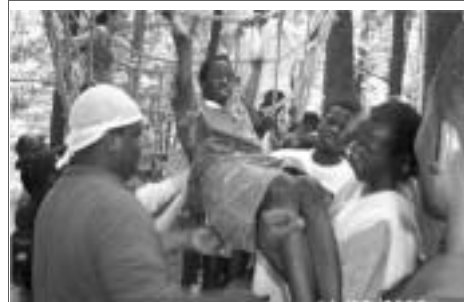
Highlights from a day of team building at Fellowship Farms.