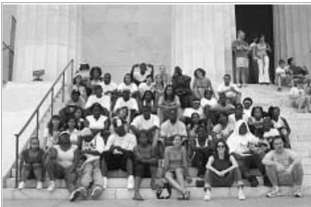
Youth VOICES summer academy participants take a break on the steps of the Lincoln Memorial during their visit to Washington, D.C.

From July 1 st to August 9 th of this year, youth from across Philadelphia participated in the UCCP's first ever Youth VOICES Summer Academy . For six weeks, participants met daily in their own communities to identify and address issues of importance in their neighborhoods. They were guided, challenged and inspired by Temple students who served as Summer Academy instructors and special project managers.