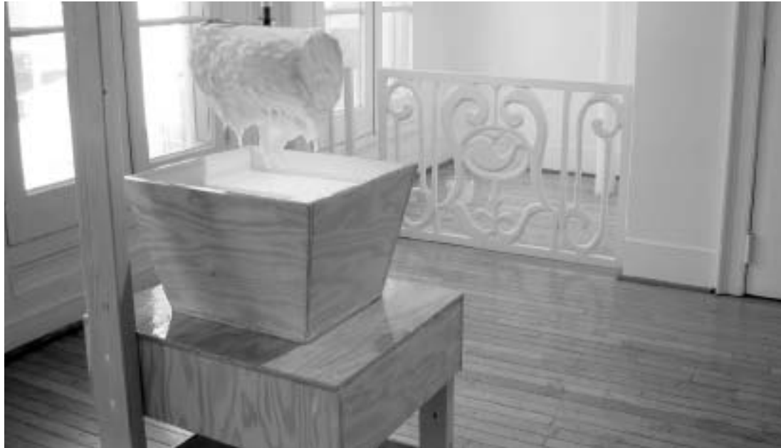
Emily Blaskovich ('05), MFA Thesis Exhibition, April 2005

Tyler Summer Workshop Deadline to register is June 15, 2006. Contact Tyler.Conted@temple.edu or 215.782.2760.