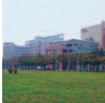
National Taipei University

TAIPEI, THE CAPITAL OF TAIWAN, is a large urban area in the northern part of Taiwan with a population of over 2 million. Taipei serves as the nation's major center for politics, commerce, mass media, education, and pop culture. The city is currently the site of 18 universities and a number of major museums and libraries. A modern metropolis in every sense of the word, Taipei boasts sleek glass and steel architecture, an advanced transportation system, and a vast, lively scene of shopping malls, arts venues, hotels, restaurants and night spots. While the city embraces modernity, cultural traditions and arts continue to thrive and color daily life in Taipei.