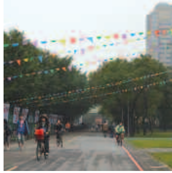
National Taiwan University

TAIWAN IS A FASCINATING MIX of technological innovation and traditional Chinese culture. Known for indigenous cultures and cuisines, Taiwan is one of the only places on earth where ancient religious and cultural practices still thrive in an overwhelmingly modernist landscape. On any given day, one can experience this unique juxtaposition of old and new, witnessing time-honored cultural practices while still taking in technological milestones such as the world's tallest building, Taipei 101, and the new High Speed Rail that links the island's two largest cities.