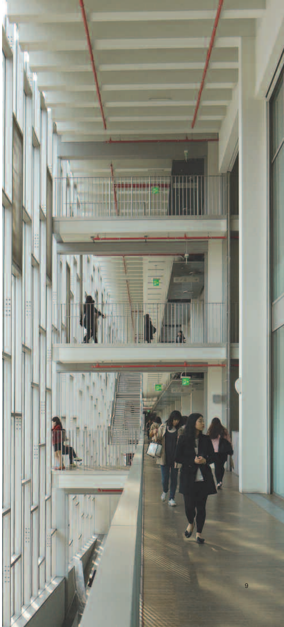
Inside Ewha's Campus Complex building

Courses in English: Asian studies, biology, business, chemistry, economics, engineering, Korean studies, literature, math, physics and political science. Korean language courses are also available. Students proficient in Korean may have additional course options.