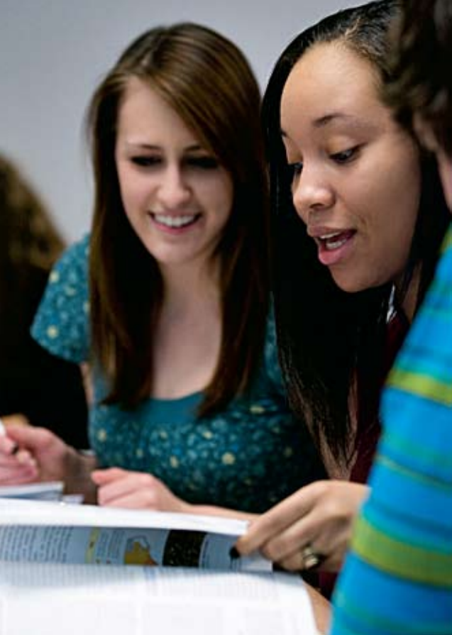
The nearly 500 Honors Program students living in the residence hall at 1300 Cecil B. Moore Ave. can take courses in a classroom just a few steps from their suites.