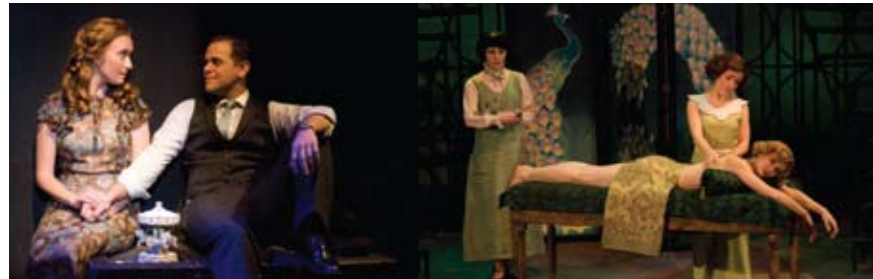
The Time of Your Life