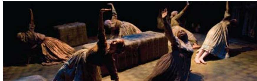
The Darker Face of the Earth