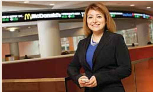
From top left clockwise: New building for Tyler School of Art; one of the longest stock tickers in the U.S. in the new Fox School of Business building, Alter Hall; renovated Baptist Temple; and new Medical Education and Research Building.