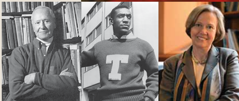
Robert Merton, Bill Cosby and Shirley Tilghman