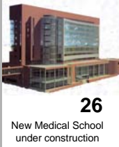
26 New Medical School under construction