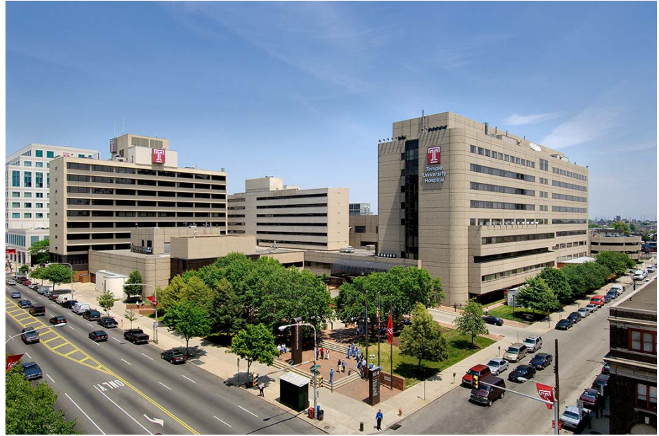
Temple University Hospital