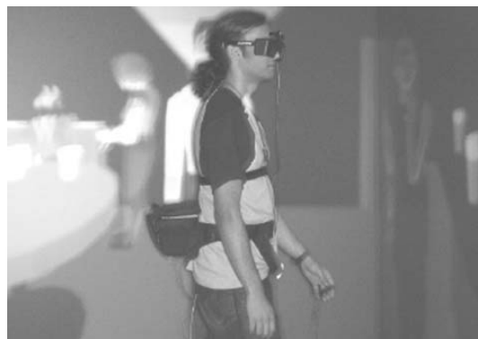
Figure 1: Participant in the Cave

At four points during the experience, the walls of the Cave were blanked out, leaving participants in a completely white room for approximately 2 seconds. Two experimental minders observed them throughout, noting their bodily and verbal responses to the whiteouts. Participants’ autonomic responses were also monitored throughout. Figure 1 shows a participant in the bar environment, wearing the physiological monitoring equipment.