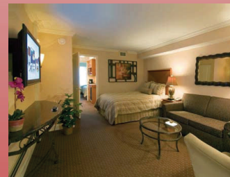
Queen Suite Living Room