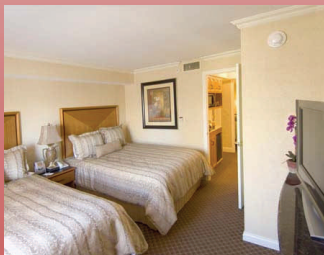
Queen Suite Bedroom Area