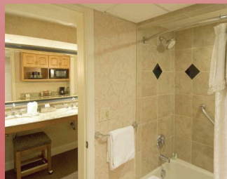
Queen Suite Bathroom Area