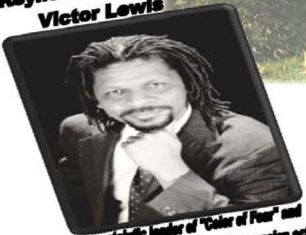
catalytic leader of "Color of Fear" and internationally recognized anti-apartheid activist