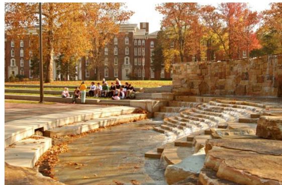
Amphitheatre / Fountain