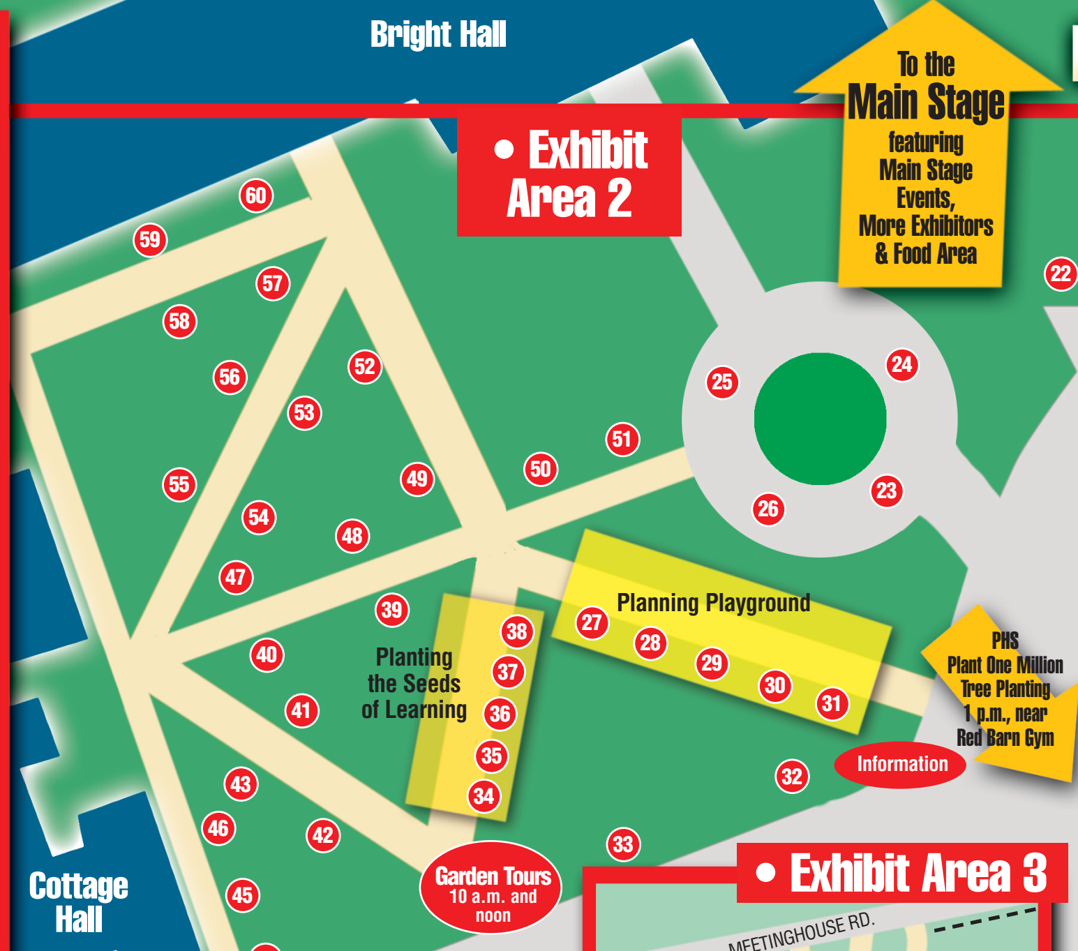
Exhibit Area 3